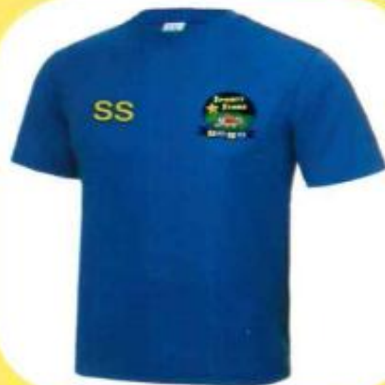
T-SHIRT £14 £12

SCAN THE QR CODE TO SEE OUR OTHER ITEMS AND ORDER.