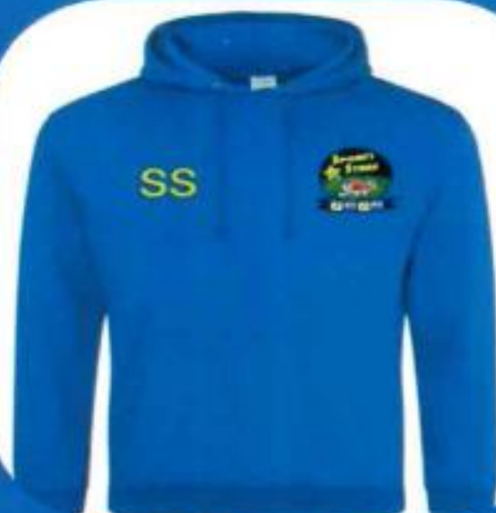
HOODIE £20 £18