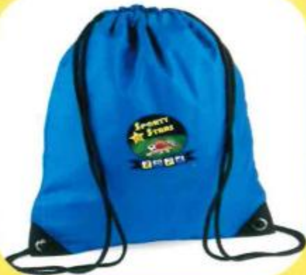
DRAWSTRING BAG £10 £8