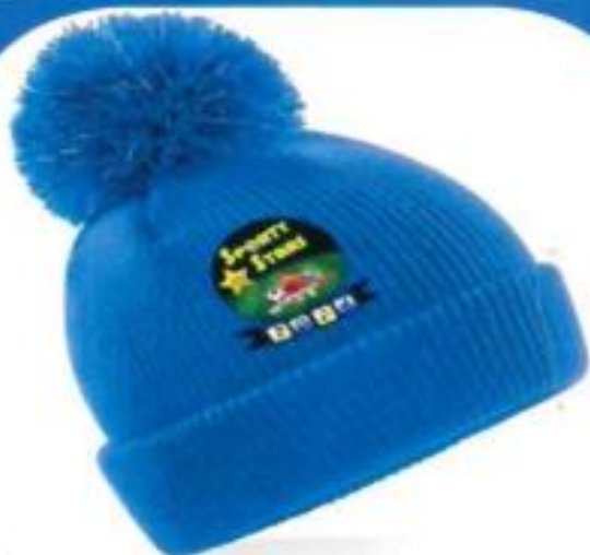
BEANIE £12 £10